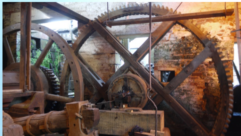
Tilt Hammer Abbeydale Industrial Hamlet 1785

Historical buildings, theatres, gardens and the natural beauty of the Peak District - Britain's first national park - are all within easy reach.