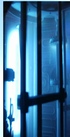
HIPIMS Discharge at Sheffield Hallam University 2003