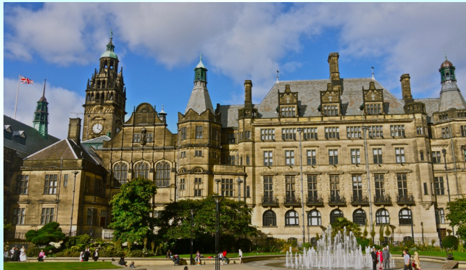
Town Hall 1897