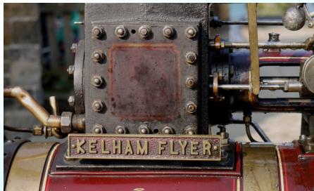
Steam Engine - Kelham Island Museum